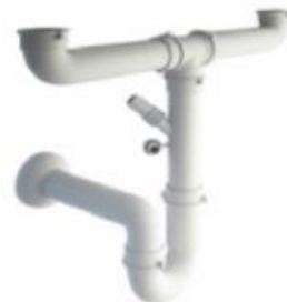
U - TRAP / SIPHON CODE NO. 096010