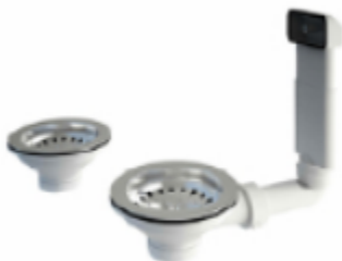
WASTE FITTING 3" CODE NO. 095030